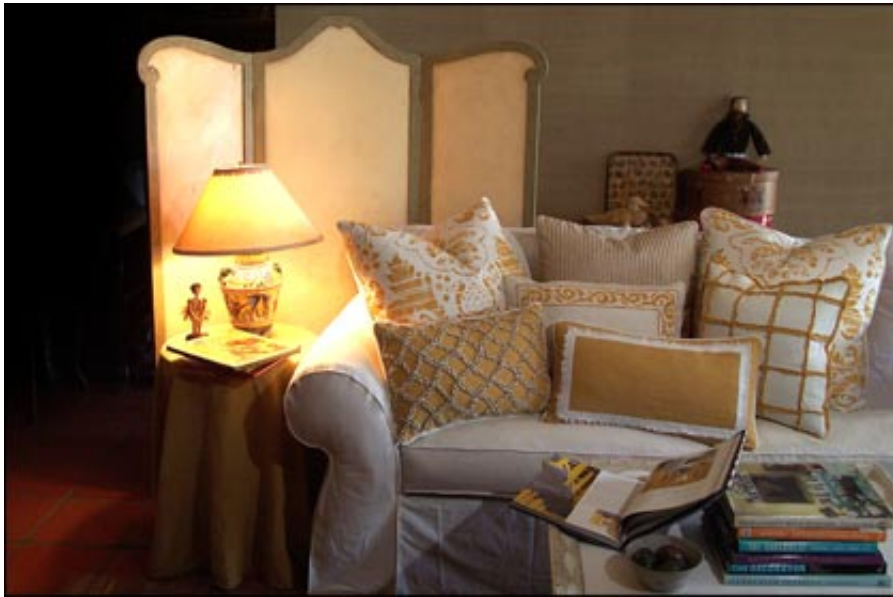
And More Pillows...