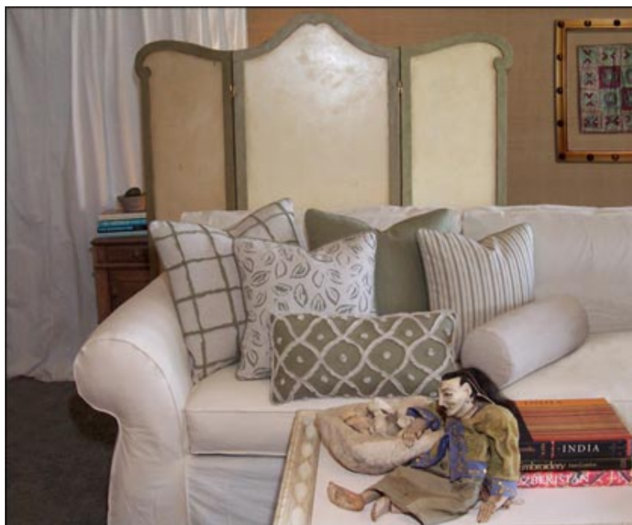
More Hand Stencil Printed and Hand Painted Pillows...